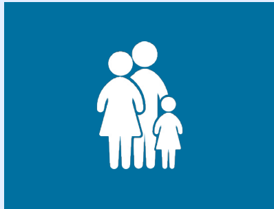
High Net Worth Individuals & Families