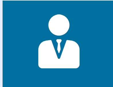
Corporate Executives & Professionals