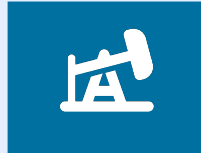
Real Estate Developers & Oil and Gas Interest Holders